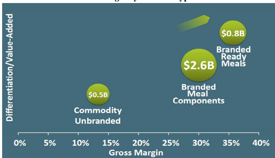
Gross Margin by Product Type