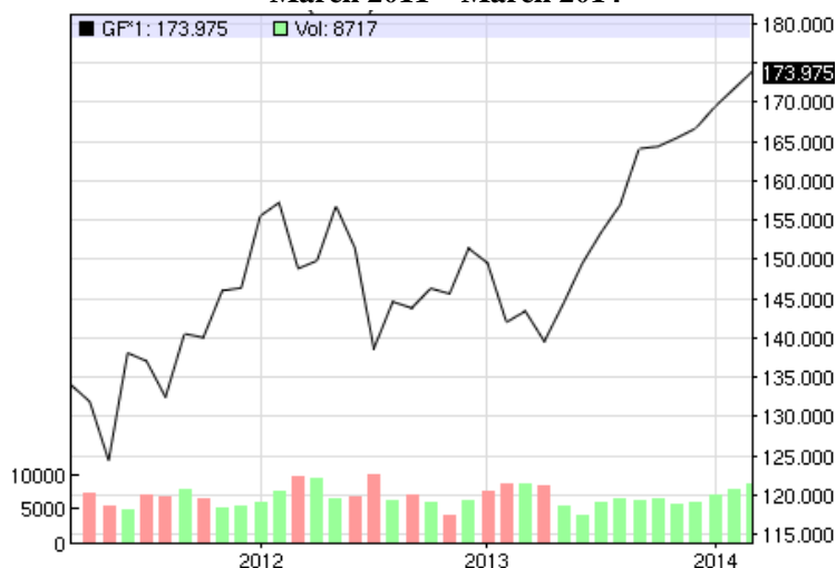
Exhibit 4 Daily Feeder Cattle Price & Volume (CME) March 2011 – March 2014