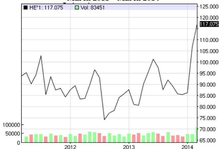
Exhibit 3 Daily Lean Hog Price & Volume (CME) March 2011 – March 2014

Gross margin expansion is contributing to the operating margin improvement driven by two factors. First, Hillshire will accelerate new product growth around faster-growing categories, such as branded meal components and ready meals, which carry higher gross margins of 30-35% compared to commodity products closer to 15% (Exhibit 2) and company average of approximately 30% in fiscal 2013. It will also extend into higher margin categories, such as snacking and introduce premium innovation. Second, productivity is expected to generate 3-4% of savings on average annually from labor and material cost reductions, as well as improved manufacturing efficiencies. Together these efforts in conjunction with pricing should offset commodity costs over time, while also contributing to margin improvement.